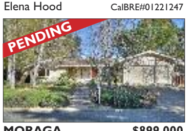
MORAGA $899,000 3/2. Great Single Level! Adorable house with great location, 1961 sqft on .24 acre